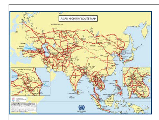
Box 1. Example of Pan Asian Connectivity

AH seeks to improve economic links between Asia, Europe, and the Middle East. It is planned as a network of 141,271 km of standardized highways—including 155 cross-border roads—that crisscrosses 32 Asian countries.